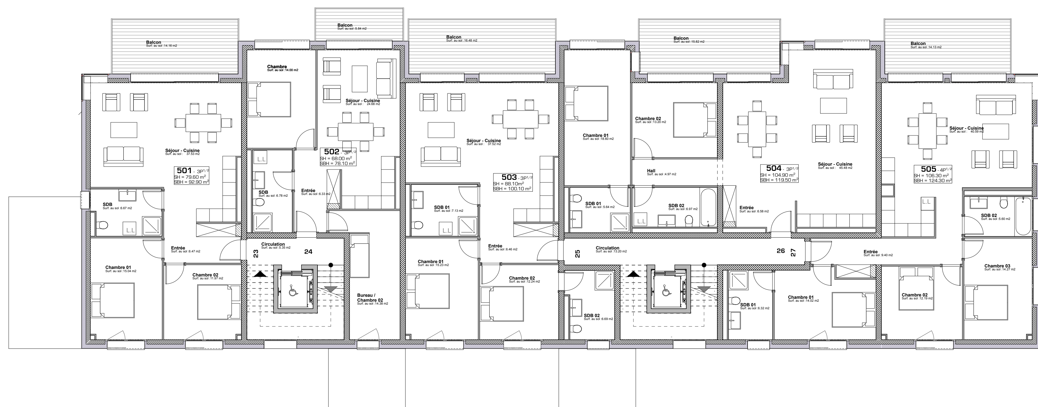
ETAGE 5 ECH. 1:100