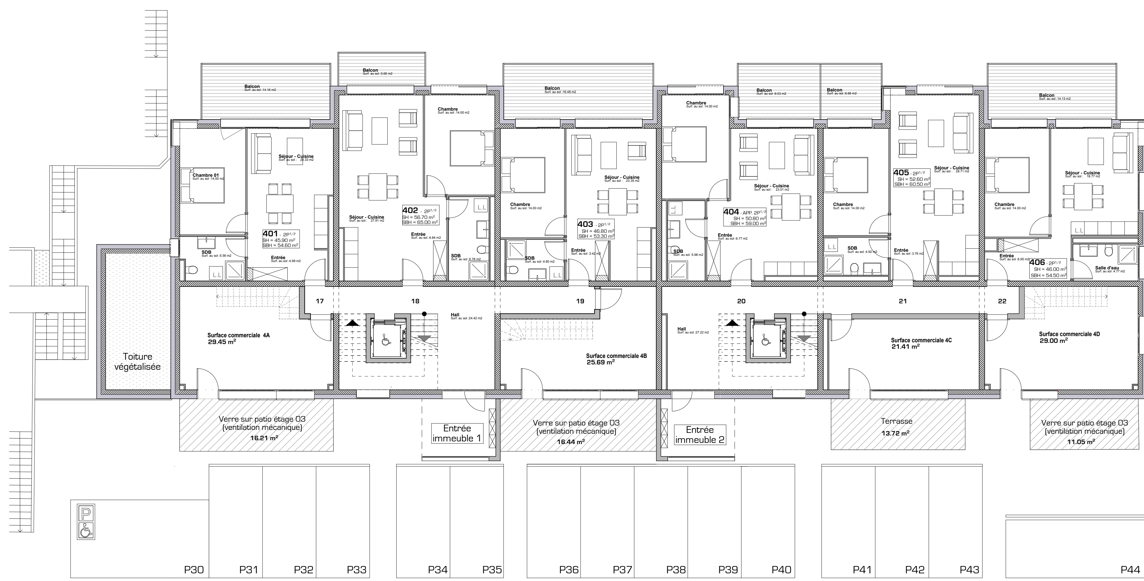
ETAGE 4 ECH. 1:100